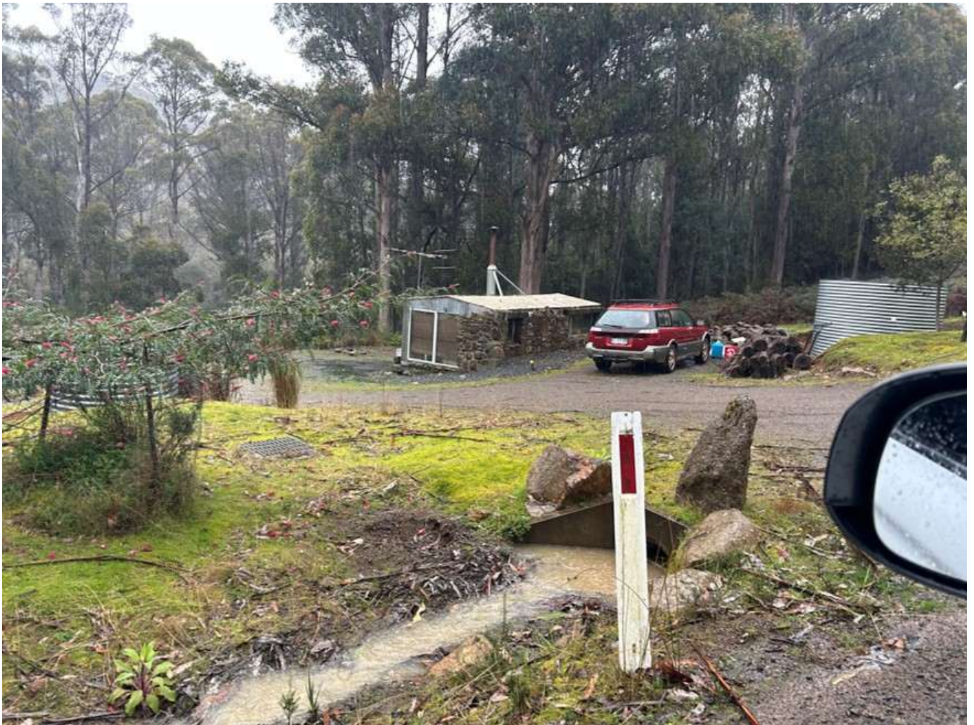
VIEW AT THE DRIVEWAY ENTRY SHOWING THE SHACK AND THE GENERAL GRADIENTS IN THE CORNER OF THE SITE

Landslide Risk Assessment, 281 Snug Tiers Road, Snug, TAS (Cont.):